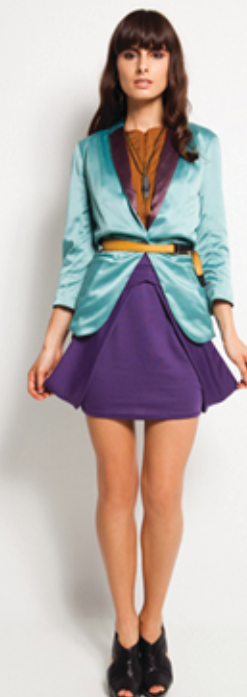
Outer: Carnelian Top: Opal Skirt: Kryptonite