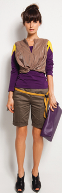
Outer: Opal Top: Indicolite Bottom: Iridot