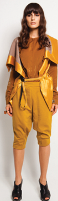
Outer: Tourmaline Top: Veramarine Bottom: Quartz