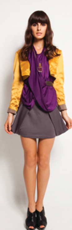
Outer: Topaz Top: Onyx Skirt: Kryptonite