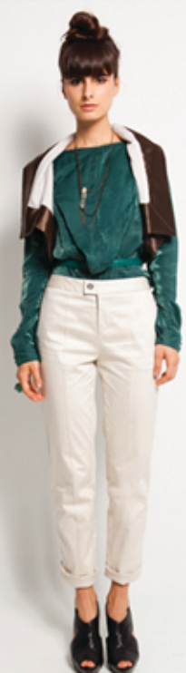
Outer: Tourmaline Top: Veramarine Bottom: Peridot