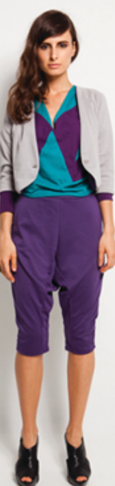
Outer: Jasper Top: Ruby Bottom: Quartz