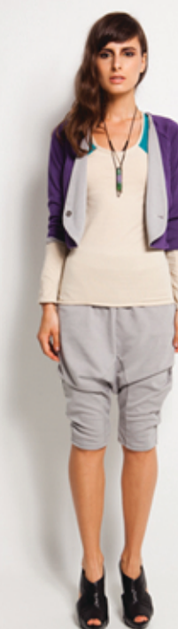
Outer: Jasper Top: Indicolite Bottom: Quartz