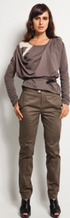
Outer: Amber Top: Indicolite Bottom: Peridot