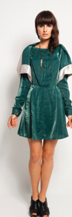
Outer: Tourmaline Dress: Alexandrite