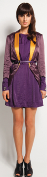
Outer: Carnelian Dress: Alexandrite