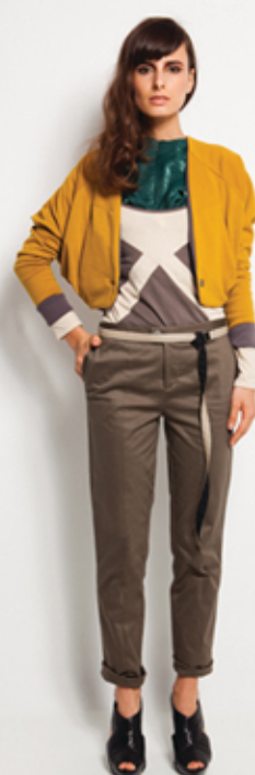
Outer: Beryl Dress: Opal, Geode Bottom: Peridot