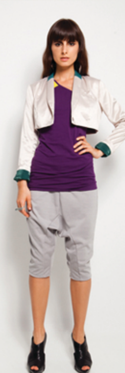
Outer: Topaz Top: Zircon Bottom: Quartz