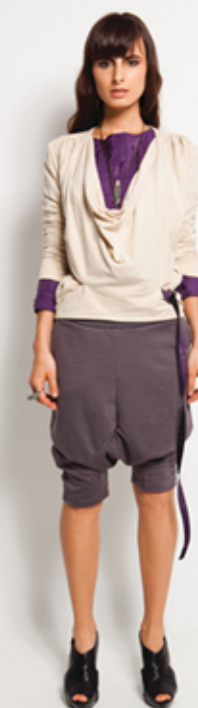
Outer: Amber Top: Veramarine Bottom: Quartz